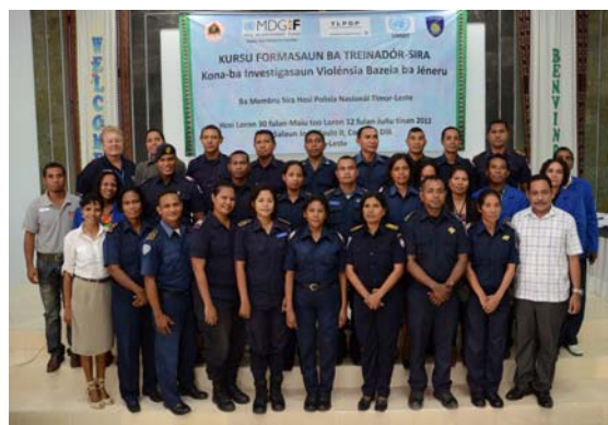
PNTL GBV Investigation Training Class with instructors, June 2012.

their expertise to turn the course into a more comprehensive training needs package, while also covering the aspects of child protection, human trafficking, investigations and recent approved legislation in the area of gender justice. Around this time, they started to discuss more efficient and effective training and started planning a joint training. In 2011, UNICEF coordinated the first joint training to NVPU in Dili District. Subsequently, joint refresher's courses for NVPU in the district were held in Baucau, Liquica, Suai, and Oecussi Districts. They were the initial steps towards the first joint training covering the LADV, trafficking, and GBV and human trafficking referral network supported by the MDG-F. In June 2012, under UNFPA's coordination, a joint Training of Trainers on GBV Investigation was held targeting 21 selected police officers from different districts. This comprehensive training covered wide range of issues in GBV investigations including theories on GBV, child protections, human trafficking, referral systems, investigation skills, and legal frameworks, involving various international and Timorese resource persons in service providers and governmental agencies 22 . All the participants including the Head of NVPU participated for two weeks fully, which shows their deep commitment to their work on GBV.