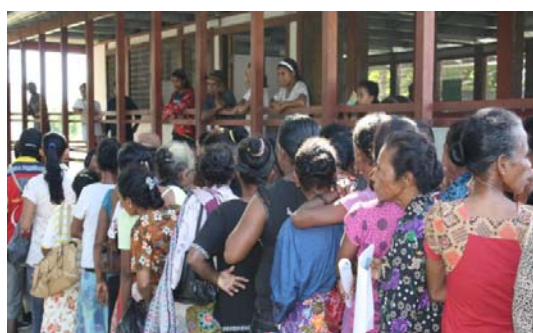
Beneficiary of Bolsa de Mae queuing at Metinaro, Dili District.

conditionality was also strengthened. The technical note led to the development of the 'Bolsa da Mãe Decree Law' which was promulgated by the President on April 23, 2012.