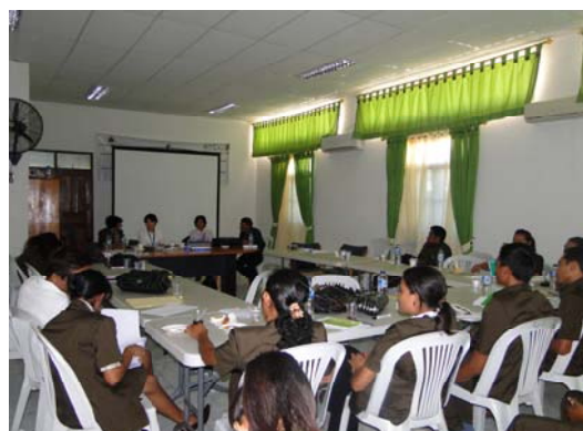
SEPI staff receiving training on GRB

Firstly SEPI staff, parliament members, and civil society received training and gained basic knowledge on GRB, as well as the analysis of the budget and the Annual Action Plan (AAP). In line with the ongoing nomination process of the Inter-ministerial Gender Working Group (I-M GWG), I-M GWG members were also sensitized to the subject of GRB and Gender Mainstreaming in their respective work. Subsequently, selected SEPI staff were also trained in the Training of Trainers (ToT) to reach out to other ministries and districts GWGs. These trained SEPI Staff conducted sensitization and training on GRB and Gender Mainstreaming at the district-level GWGs.