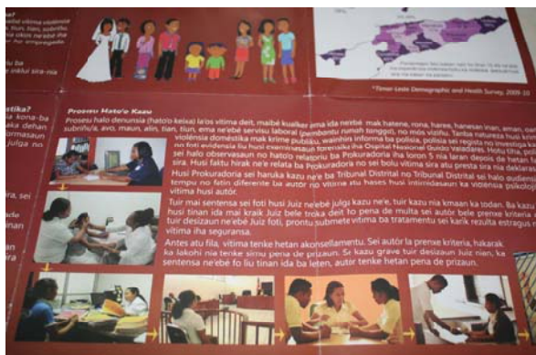
'Easy to understand' brochure on LADV