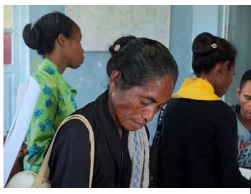
Beneficiary of Bolsa de Mae receiving the cash at Oecussi?

Improved identification of vulnerable women: UNDP's support for development of technical note on policies and implementation guidelines of 'Bolsa da Mãe (BdM)' clarified the definition and identification of vulnerability and criteria, as well as the operational procedures. This intervention was much needed to provide fair access to the most vulnerable while mitigating the potential tensions within the family. To ensure the link with increased attainment of education and vaccination, a monitoring system for compliance with the