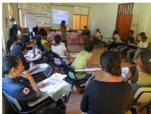
GRB Workshop in Holsa, Maliana District.

themselves in the sustainable use of the constructed facility. Given that the cultural resistance and patriarchy are still strong and stakeholders have different background at the suco-level, simpler and different approach for sensitization and guidance for suco-level community needs to be considered. A similar view was also expressed by SEPI for their intervention at the District-level.