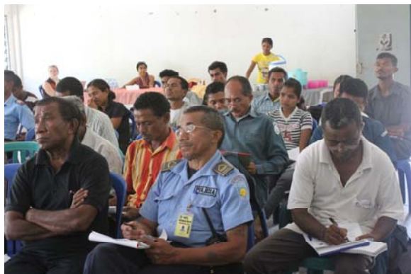
Consultations on NAP-GBV in Oecussi District.

SEPI-led ‘multi-sectoral/ multi-stakeholder’ participatory process: One of the highlights of the NAP-GBV is the way how it was consulted and drafted. The Technical Drafting Committee (TDC) comprised of 17 stakeholders 17 from various governmental and non-governmental institutions was formed under the leadership of the Office of the Secretary of State for the Promotion of Equality (SEPI) and this TDC took the initiative of drafting. Each stakeholder brought their expertise and shared their ideas. Involvement of the civil society actors brought ‘the real GBV situation on the ground’ into perspective. During this process, eight meetings were held to discuss the content, and two national and four district consultations 18 were held to raise awareness of the process and seek inputs on the required actions as well as opportunities and challenges in the area of GBV.