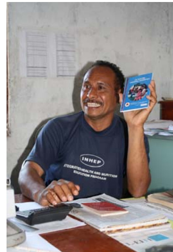
Suco-Chief in Debos, Suai District enthusiastically talking about ToT on child protection training.

types of audience over 5000 people. Adolescent girls who were trained by Suco-chief in Debos Sub-District, Suai District, expressed their satisfactions with the increased knowledge and how to report on child abuse and violence. The Suco-Chief in Debos was also grateful that he was trained as a trainer and showed his further interests in training wider audience.