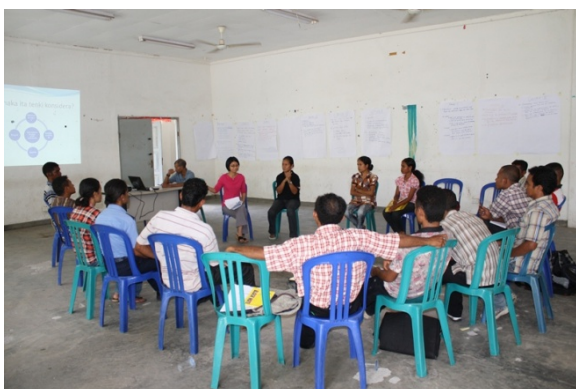
Photo: Referral Network Training- Socialization of SOPs on referring victims between service providers in Oecussi District.

Several service providers supporting victims of gender-based violence, human trafficking, and child protection exist mainly in Dili but also across the country with limited availability. They include NVPU and Child Protection Officers (both in all 13 districts); Uma Mahon (shelters) run by NGOs and churches; Fatin Hakmatek (safe rooms) run by NGOs in the grounds of regional; and legal aid NGOs. A Referral Network among the service providers had been in place but rather informal and no formal Memorandum of Understanding or referral protocol had been established to formalize the process. As pointed out in some reports including the CEDAW Initial Report in 2008, 'Roles and responsibilities of individual organizations and government institutions had not been clearly defined, sometimes prohibiting the victims of violence from benefiting from the range of assistance available from all the sectors'. 32