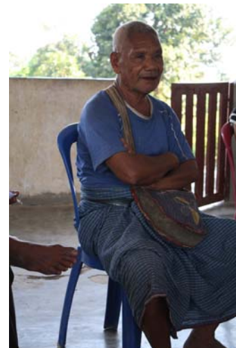
Lia nain joining the focus groups discussion on GRB and GBV.

IEC Strategy for harmonized and joint public awareness: Although, some joint IEC initiatives such as the joint production of the Directory of the Services were undertaken, more coordinated public awareness could have been organized as a UN Joint programme. According to the programme document, IEC strategy was supposed to be developed, however this was not realized and hence each agency took their own initiative. If a joint IEC Strategy was developed at the initial stage, more coordinated actions with the consistent message could have been delivered and the visibility of the programme would have been higher. Nonetheless, different initiatives for IEC on GBV, child protection, and human trafficking demonstrated good visibilities and outreach at the individual subject level.