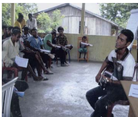
Socialization on Human Trafficking through music.

Community-based innovative awareness campaign: IOM reached 2540 people through different community-based awareness campaigns on human trafficking. It carried out socialization in 5 targeted districts 24 , trained journalists, and advocated through newspapers, TV and radio talk shows.